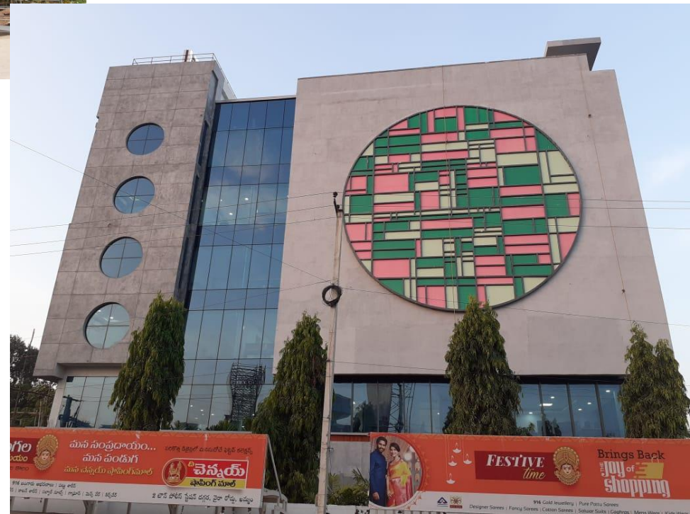
IT TOWER KHAMMAM