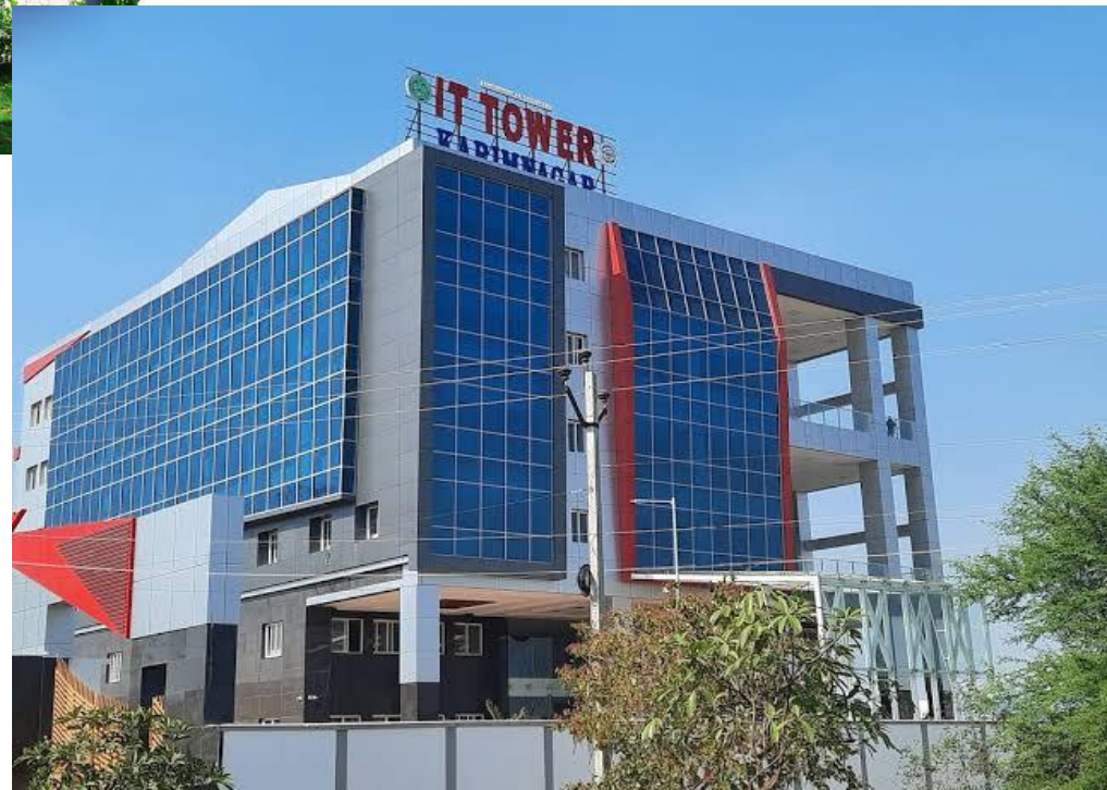
IT TOWER AT KARIMNAGAR