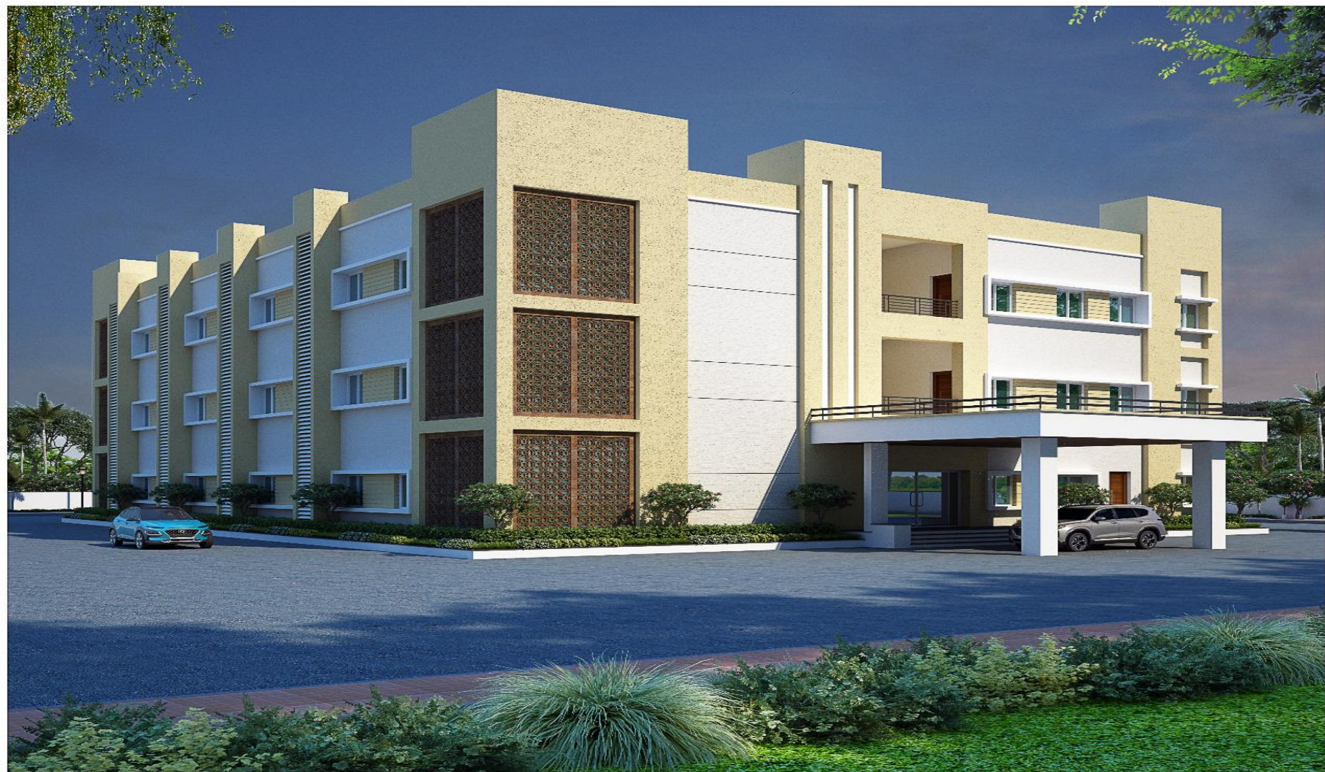
FLATTED FACTORY BUILDING AT MANDAPALLY, SIDDIPET