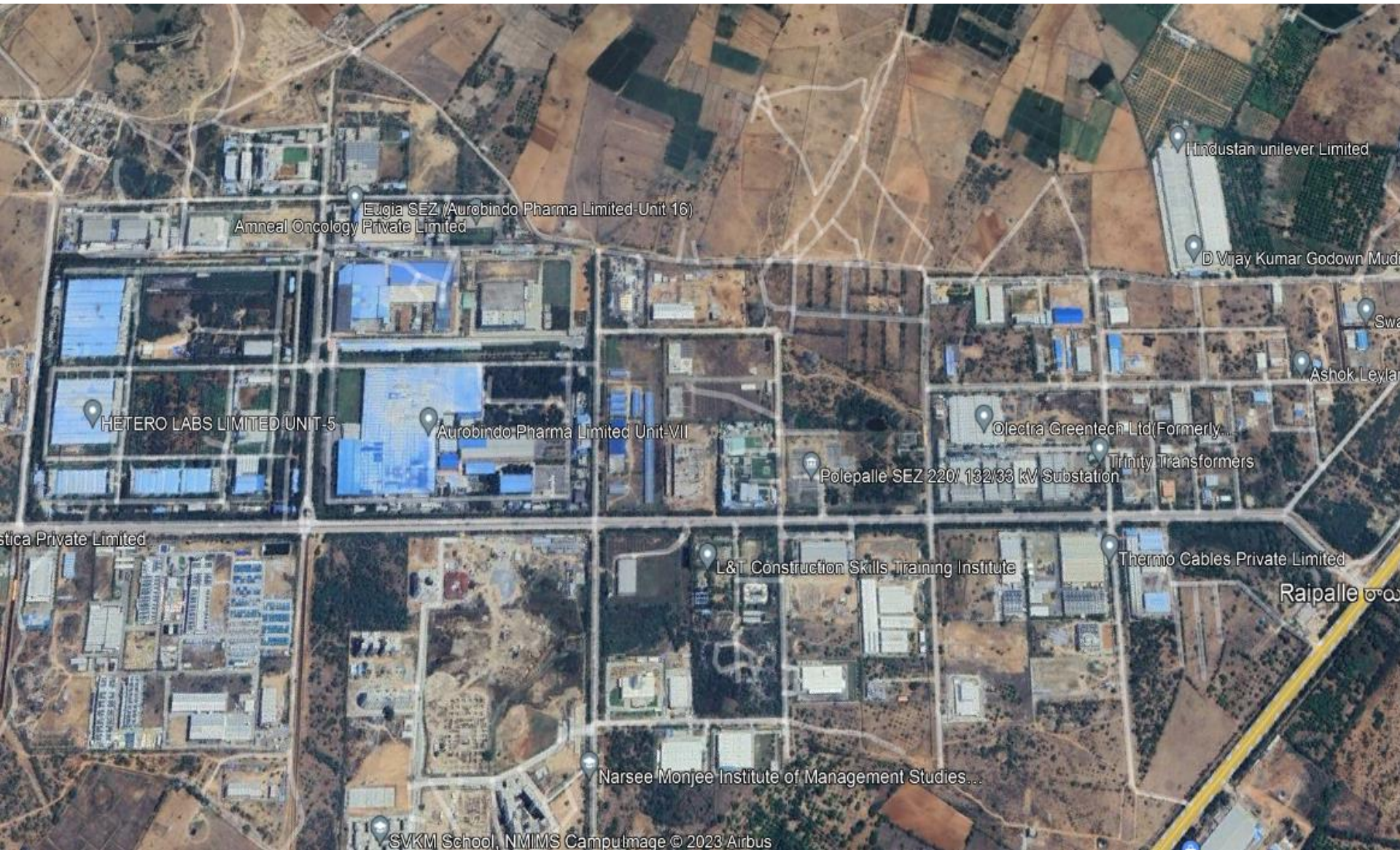
INDUSTRIAL PARK JADCHERLA, MAHABUBNAGAR DISTRICT