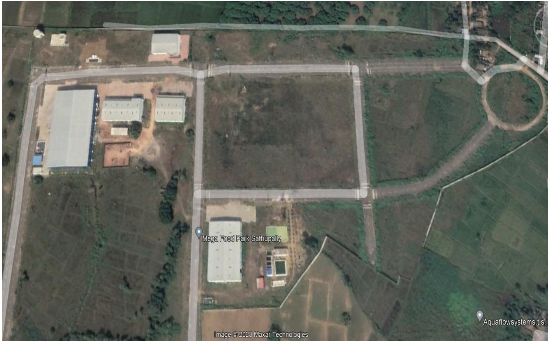
MEGA FOOD PARK BUGGAPADU, KHAMMAM DISTRICT