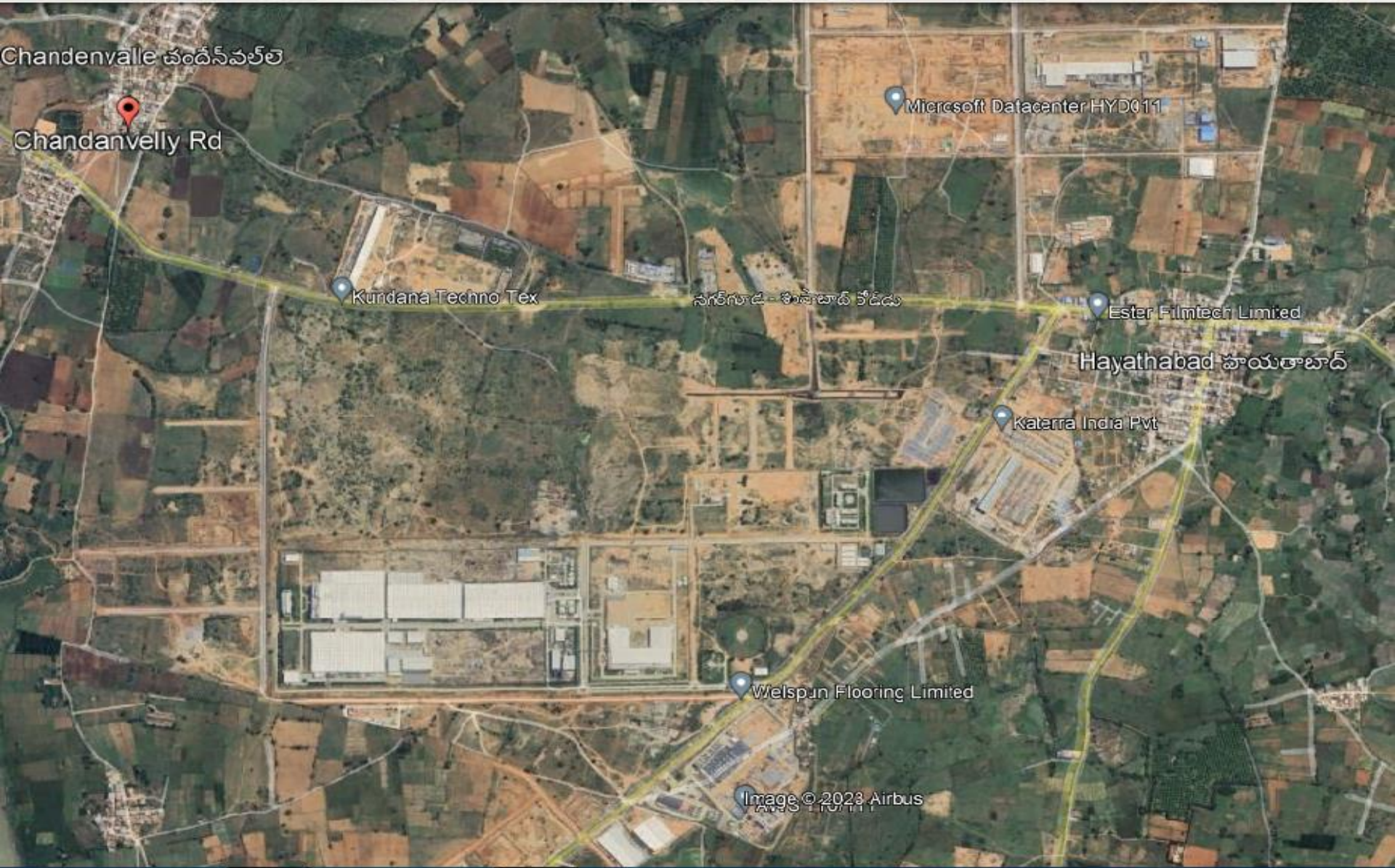
INDUSTRIAL PARK CHANDANVELLI, HYDERABAD