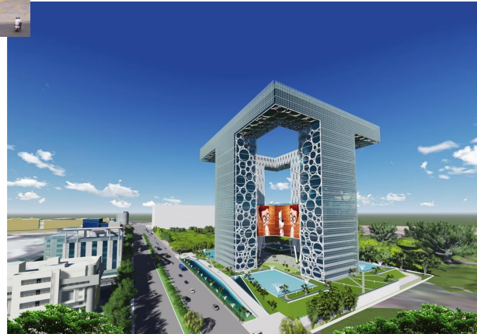
IMAGE TOWER AT KNOWLEDGE CITY RAIDURG