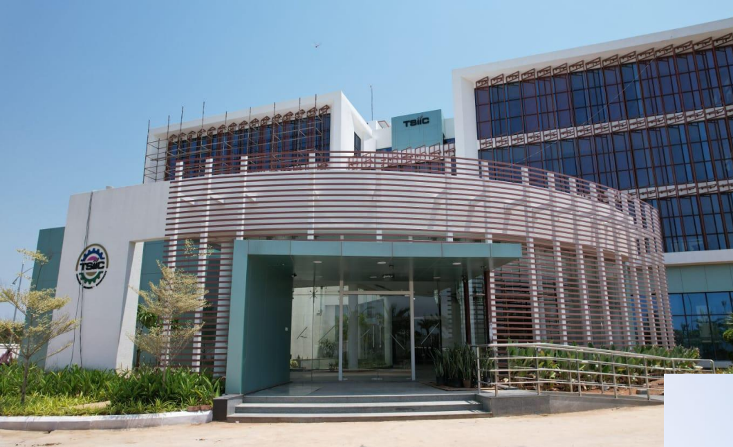
IT TOWER NIZAMABAD